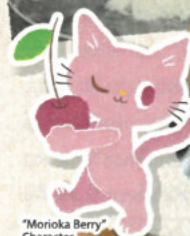
"Morioka Berry" Character Aronyan