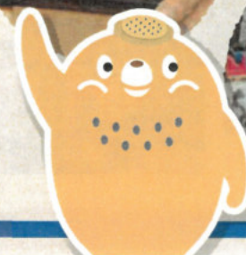
"Nanjera" Character Nan Bu Jeralino