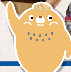
"Nanjera" Character Nan Bu Jeralino